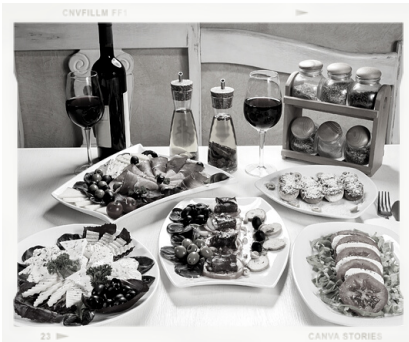
REFRESHMENTS Wine, coffee, and small morsels of deliciousness