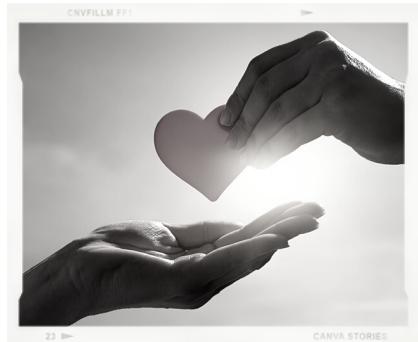
INSPIRED GIVING Invitation for attendees to impact the mission of MRH through their donations