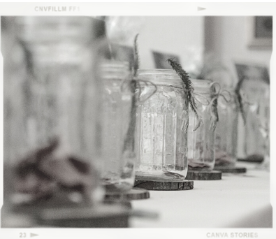
RAFFLE / AUCTION Raffle prizes, experiences, and auction of an individual's "story" for the show title