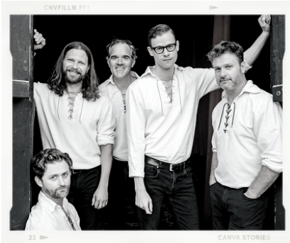
THE IMPROVISED SHAKESPEARE COMPANY IMPROVISEDSHAKESPEARE.COM